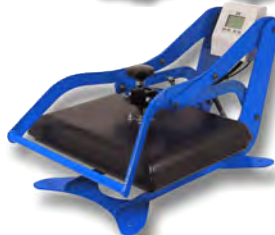
DK20 16" x 20" (41 x 51 cm) Digital Clamshell