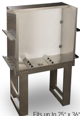
Fits up to 25" x 36" screens