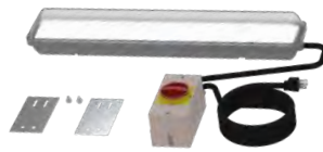
Optional light kit fits new and existing Vastex washout booths with translucent back panel. May fit other brand booths.