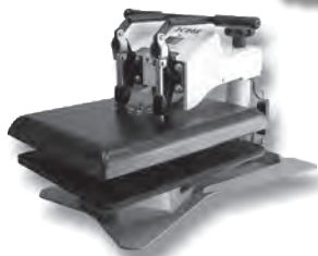
DC20S 16" x 20" (41 x 51 cm) Digital Swinger