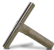
Optional Vacuum Tool removes excess water from screens for quicker drying