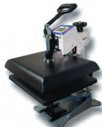
DC16 14" x 16" (36 x 41 cm) Digital Combo