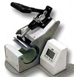
DK3 Digital Mug Press