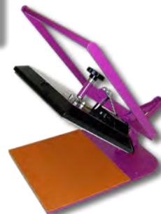
JetPress 14 12" x 14" (30 x 36cm) Clamshell