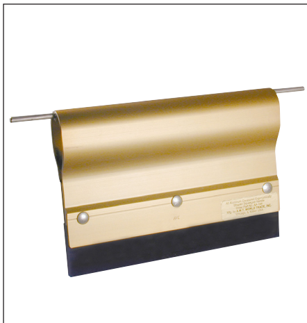
All-aluminum, ergonomically shaped squeegee holder with Poly-Supreme™ Plus squeegee blade (included).