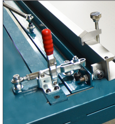
Ensure tight tolerances with the Micro Registration Lock-in feature.