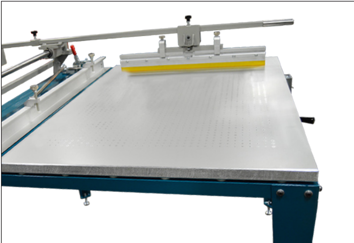
Optional Side Arm feature reduces operator fatigue and ensures consistent print stroke and quality.