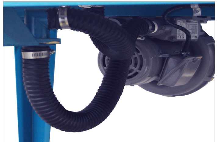
The Accu-Glide comes standard with a heavy-duty Max-Air Vacuum Motor.